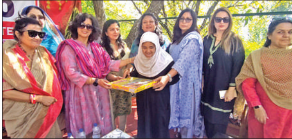
Members of IASOWA, J&K distributing stationery and sports gears among students at Srinagar.