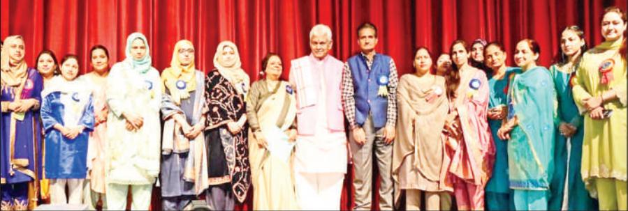
LG Manoj Sinha attending Founder's Day Celebration of Devki Arya Putri Pathshala at Srinagar on Tuesday.

"Strength of the nation is determined by knowledge, culture and values. Educational institutions should focus on building human values, knowledge, social consciousness to enable the young minds to shape their future life and des-