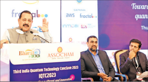
Union Minister Dr. Jitendra Singh delivering keynote address at the "3rd India Quantum Technology Conclave 2023" organised by ASSOCHAM at New Delhi on Thursday.

Dr Jitendra Singh said the Anusandhan National Research Foundation (NRF), announced by Prime