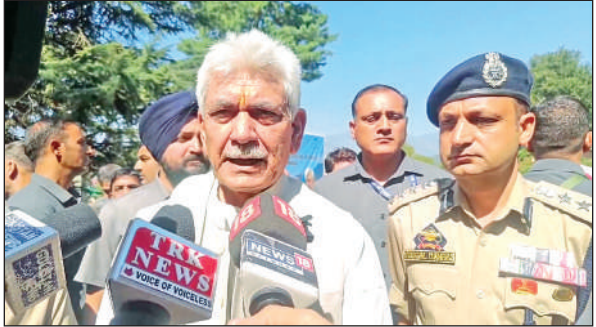
LG Manoj Sinha briefing media at Kupwara on Friday.

"Electricity has reached the far-flung areas and works under Jal Jeevan