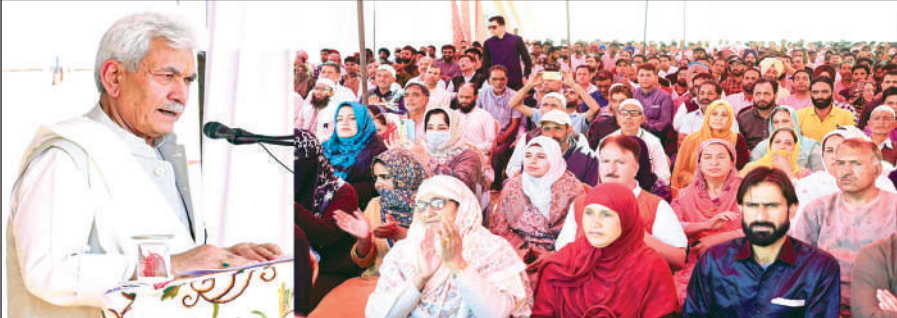
LG Manoj Sinha speaking after inaugurating Rabi Campaign in Baramulla on Friday.

■ STATE TIMES NEWS BARAMULLA: Lieutenant Governor Manoj Sinha on Friday expressed confidence that with the hard-work of farmers, extension of scientific knowledge and technologies, by tapping the potential of diversification and inter-cropping and robust linkages for end-to-end operations, from sowing to selling, Jammu and Kashmir will become the number one region in terms of farmer's income in the next 4 years. "It is a golden era for agri-