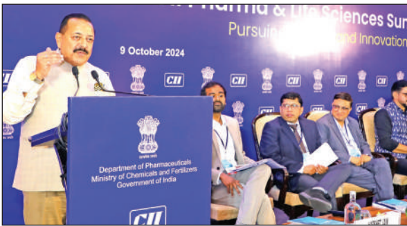
Union Minister Dr Jitendra Singh addressing the "CII Pharma & Life Sciences Summit: 2024" at New Delhi.

The Minister said, "This forum is a vital platform for the exchange of ideas among industry leaders, government officials, and academia, and exemplifies India's