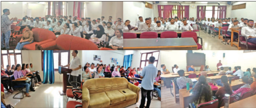
IIC, JU in collaboration with various Departments, Centers, and Schools of University of Jammu, during interactive sessions.