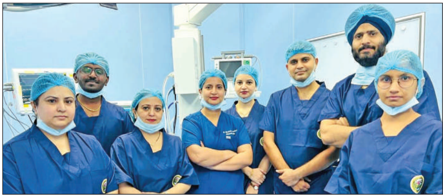
AIIMS Jammu doctors team after performing successful Thyroid Tumor Surgery