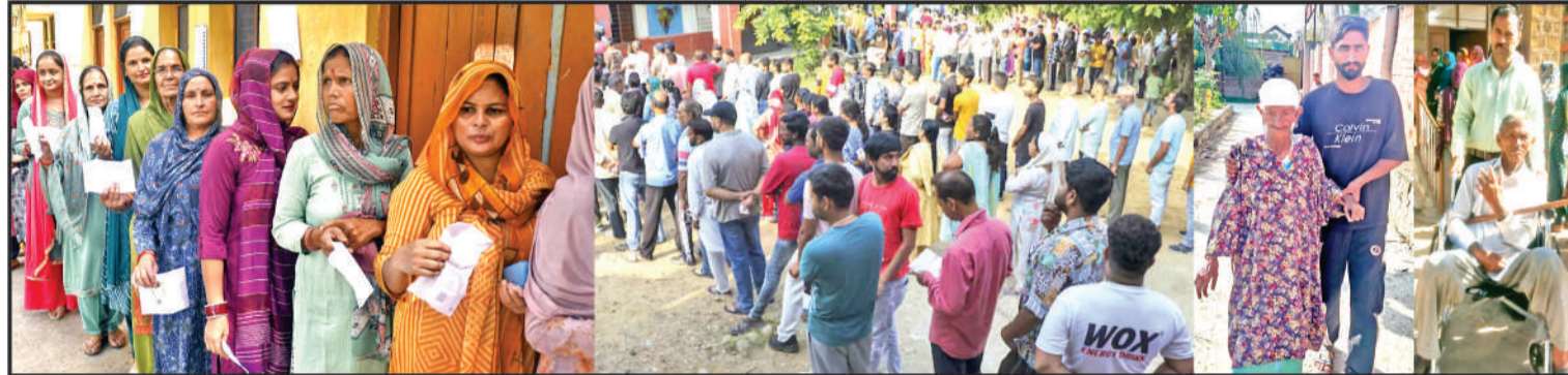
Elderly, specially-abled among others participate enthusiastically in J&K Assembly elections across various polling stations on Tuesday. (more pics on pg-5)

STATE TIMES NEWS JAMMU: A voter turnout of 69.65 per cent was recorded in the third and final phase of voting Tuesday in the assembly elections in Jammu and Kashmir, the Chief Electoral Officer (CEO) said.