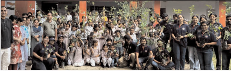
SMVDU officials along with students and faculty members of school.

■ STATE TIMES NEWS KATRA: The National Service Scheme (NSS) volunteers of SMVDU University organized a comprehensive awareness programme titled "Ek Ped Maake Naam" at Government Middle School, Dheerti, Zone Reasi. NSS unit donated 200 plant saplings to the students of the school. Each student was given 2 saplings to be planted at their home. The event