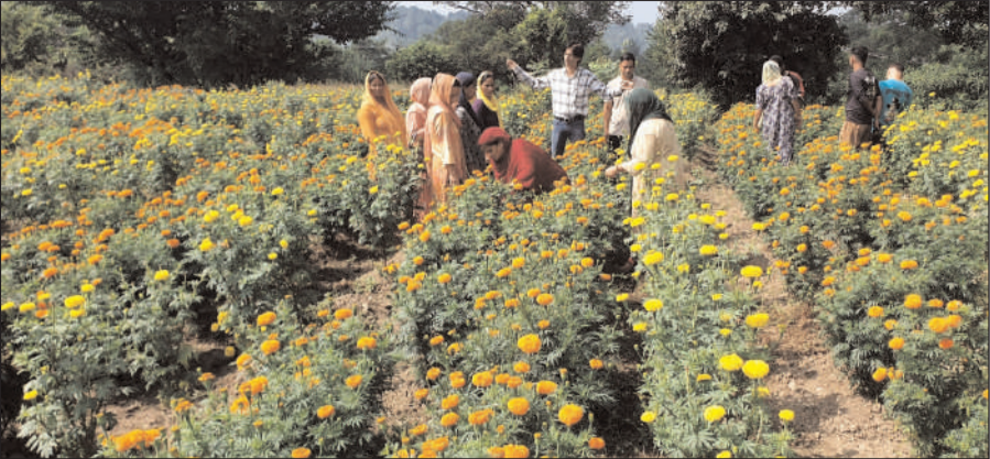
KVK Reasi scientist guiding farmers on commercial floriculture at Bhaga village in Reasi distt.