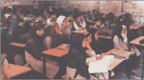
Students participating in lecture.

■ STATE TIMES NEWS RAJOURI: Keeping in view the Indian Army's core objective of maintaining cordial relations with local citizens a "Lecture on Bad Effects of Tobacco" for spreading awareness amongst young generation as well as local populace was organised. This lecture helped to promote and spread the knowledge on best practices to boost physical & mental wellbeing amongst local people of all age groups of Naili. Refreshments were also offered to the invitees. A total strength of 142 including (12 Gents, 60 Boys and 70 Girls) attended the lecture. During this event, representative of Indian Army briefed the children and youth about tobacco that has become the most common thing these days and many youths are destroying their lives by getting addicted, leading to irreversible damage to lungs, heart and other vital organs. It leads to addiction and causes behavioural changes. Tobacco has an impact on the brain which can lead to depression, conduct problems, personality disorders and can also lead to other serious health risks including