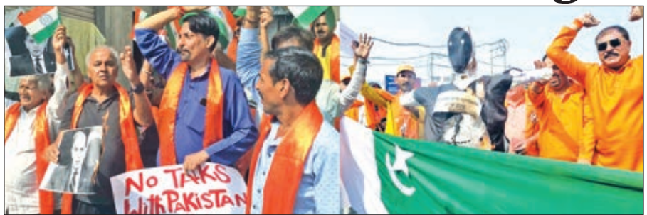
Various organisations staging protest in Jammu on Monday.