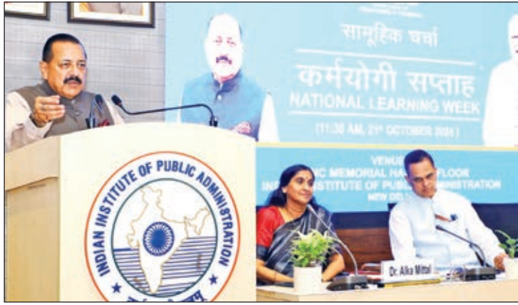
Union Minister Dr Jitendra Singh addressing "Samuhik Charcha" session of "Karmayogi Saptah", at New Delhi on Monday.

The Union Minister outlined how the Ministry of Personnel, Public Grievances and Pensions has been the first among the ministries to start this cycle of regular learning. During the occasion, Minister also recounted the journey of setting up Mission