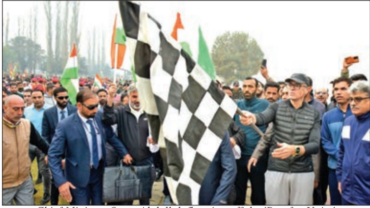
Chief Minister Omar Abdullah flagging off the 'Run for Unity'.