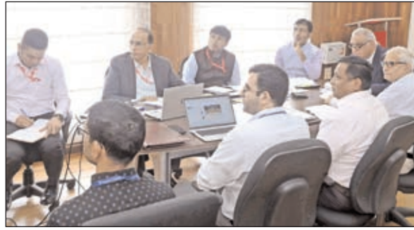
Management members during the meeting.