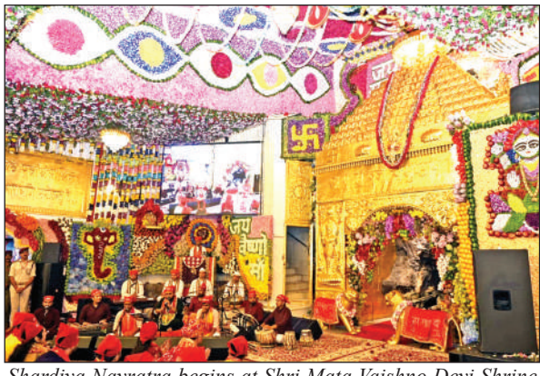
Shardiya Navratra begins at Shri Mata Vaishno Devi Shrine with sacred Shatchandi Yagya on Thursday.

STATE TIMES NEWS JAMMU: Amid multi-tier security arrangements, the nine-day-long festival of Navratri began with religious fervor, as over 45,000 pilgrims undertake the pilgrimage daily to pay obeisance at the cave shrine of Mata Vaishnodevi in the Trikuta hills. The Shri Mata Vaishno Devi Shrine Board (SMVDSB), which manages the yatra, has started new registration counters at the Katra railway station to ease the process for the pilgrims in light of the expected influx during the Navratri period. The Mata Vaishno Devi shrine in Katra has been adorned with indigenous and foreign flowers, and large pandals have been set up in the Bhawan area for the auspicious occasion. "I congratulate all the devotees on the occasion of Shardiya Navratri. We welcome them here and hope that thousands of pilgrims