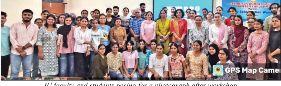
JU faculty and students posing for a photograph after workshop.