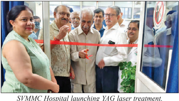
SVMMC Hospital launching YAG laser treatment.

This innovative treatment is being offered at affordable prices, reflecting the hospital's steadfast commitment to humanitarian service guided by the principle of "Nar Sewa, Narayan Sewa." Since its inception, the hospital has prioritized community welfare, focusing on providing accessible healthcare solutions to all. The launch event was attended by a distinguished