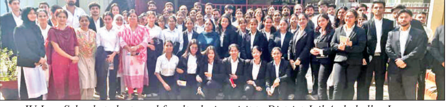
JU Law School students and faculty during visit to District Jail Ambphalla, Jammu.

This visit aimed to provide budding lawyers with an authentic understanding of the criminal justice system. The students engaged enthusiastically with both prison officials and inmates for over five hours. Two liaison officers offered valuable insights into the history and significant aspects of prison administration, guiding the stu-