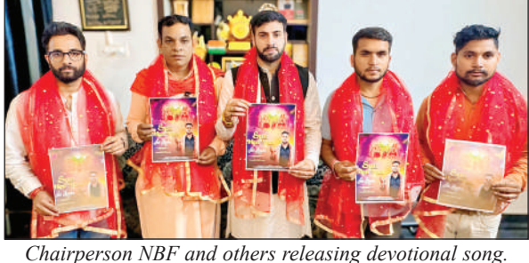
Chairperson NBF and others releasing devotional song.

that young artists merit significant support from organizations dedicated to the promotion of art and culture, in addition to electronic media.