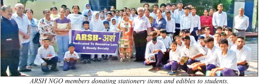
ARSH NGO members donating stationery items and edibles to students.