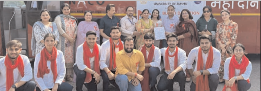
Law School NSS Unit-III students with faculty and SOTTO members at a programme.