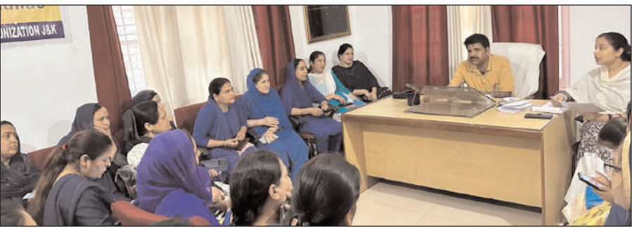
Deputy CMO Poonch interacting with staff.