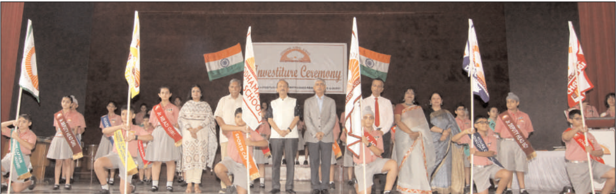
Students Council members of Jodhamal Public School with faculty and chief guest.