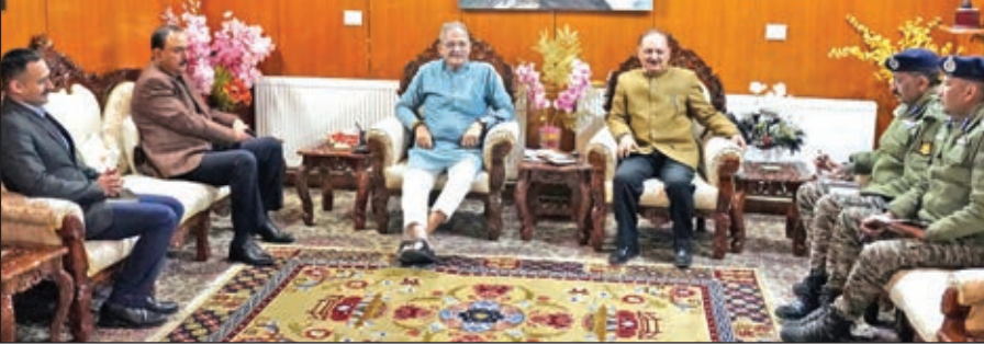
LG Kavinder Gupta chairing a meeting at Leh on Thursday.

■ STATE TIMES NEWS LEH: In a significant development reflecting the return of peace and stability, the Union Territory of Ladakh has witnessed complete restoration of normalcy with uninterrupted internet services, smooth functioning of educational institutions, and resumption of public transport and other civic activities, as restrictions in Ladakh have been lifted in view of the people's cooperation and responsible behavior. Chairing a high-level security review meeting here today, the Lieutenant Governor, Kavinder Gupta, expressed satisfaction over the prevailing calm and order across the Union Territory. He commended the efforts of the civil and police administration, security forces, and the people of Ladakh for their collective role in maintaining peace and harmony. The Lt Governor said that the people of Ladakh have