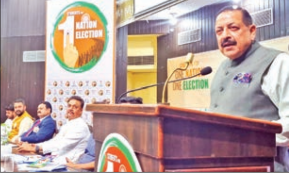
Union Minister Dr Jitendra Singh addressing the Student/ Youth Leaders' Conference at Jammu University of Jammu.

■ STATE TIMES NEWS JAMMU: Union Minister Dr. Jitendra Singh, addressing a programme titled "Students for One Nation One Election" at the University of Jammu (JU), strongly advocated for simultaneous elections across India, calling them essential for consistent national development and effective governance. Dr. Singh argued that the current practice of frequent elections disrupts governance, leads to policy paralysis, and results in a significant drain on financial and human resources. He said the continuous electoral cycle encourages the culture of freebies, opportunism, and distracts political parties from governance. "Such haphazard elections also tend to corrupt the voter," he