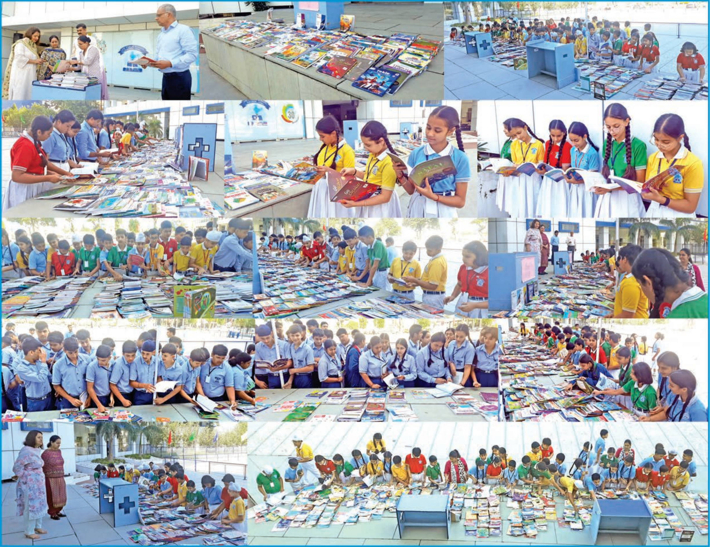
Glimpses of book exhibition at JK Public School Kunjwani.

■ STATE TIMES NEWS JAMMU: JK Public School, Kunjwani, organized a two-day Book Exhibition on 8th and 9th October 2025 for the students of Classes VI to X. The exhibition was held with the objective of