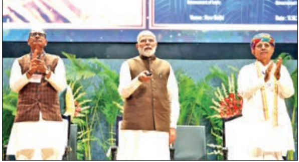
PM Narendra Modi dedicating various projects and schemes in Agriculture and Allied Sectors at Indian Agricultural Research Institute, in New Delhi on Saturday.

address, the Prime Minister compared his government's record with that of the Congress, saying the Opposition party's neglect had led to a weakening of the farming ecosystem, with different departments functioning "in multiple directions without coordination".