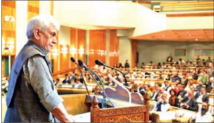
LG Manoj Sinha speaking at the 2nd edition of Kashmir Literature Festival on Saturday.

"Today the young historians must provide accurate and factually correct accounts challenging those lies. In the last few years, new writers have tried to do justice to the injustice done to the history of India, which is an excellent initiative. Efforts are also being made to take Indian literature to the world, which is highly