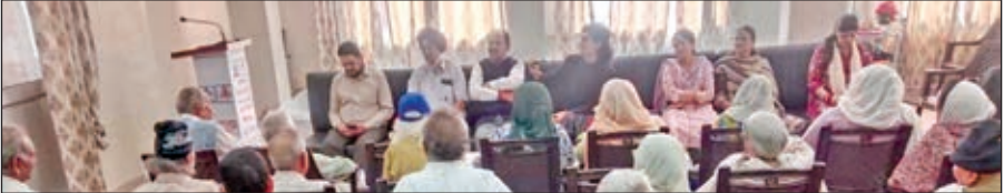
DLSA Jammu members during legal awareness camp at Home for the Aged and Infirm.