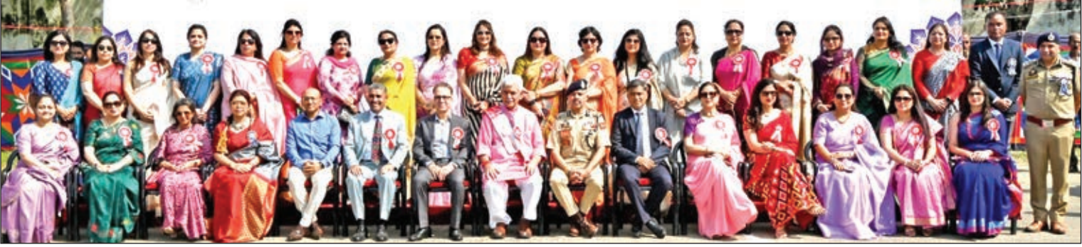
Lieutenant Governor Manoj Sinha along with other dignitaries posing for a group photograph after inaugurating J&K Police's Diwali Mela 2025.

JAMMU: Lieutenant Governor Manoj Sinha inaugurated the J&K Police's Diwali Mela -2025 at Gulshan Ground, Jammu on Tuesday. He paid tributes to the Bravehearts of J&K Police who devoted their lives in the service of the nation.