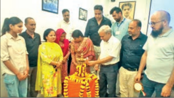
Dignitary lighting ceremonial lamp.