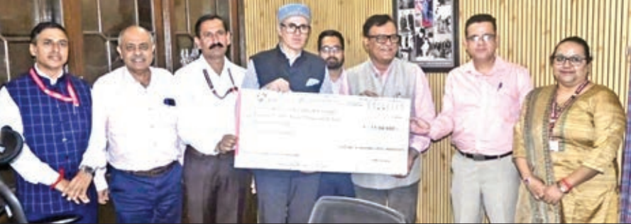
SMVDU delegation presenting a cheque towards the Chief Minister's Flood Relief Fund.

JAMMU: Several individuals and public delegations on Thursday met Chief Minister Omar Abdullah at his official residence here and apprised him of various developmental and public welfare issues. On the occasion, a delegation from Shri Mata Vaishno Devi University (SMVDU) faculty presented a cheque of over Rs 11 lakh towards the Chief Minister's Flood Relief Fund. The contribution, made