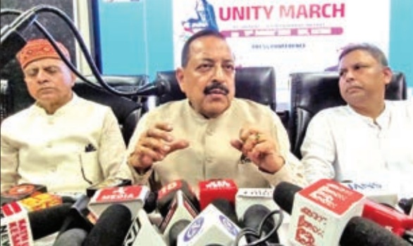
Union Minister Dr. Jitendra Singh briefing the media after flagging off and participating in the inaugural "Unity March" "Padyatra" commemorating 150th birth anniversary of Sardar Patel at Kathua on Thursday.

KATHUA: Union Minister Dr. Jitendra Singh on Thursday flagged off the inaugural 'Unity March-Ek Bharat, Akhand Bharat' Padyatra in Kathua as part of a nationwide campaign commemorating the 150th birth anniversary of Sardar Vallabhbhai Patel. The march began from Dream Land Park and culminated at Government Degree College, Kathua, with enthusiastic participation from students, NCC cadets, public representatives, and locals. Addressing the gathering after the march, Dr. Jitendra said the Sardar@150 Unity March aims to instill a spirit of unity, patriotism, and duty among the youth. He remarked that had Sardar Patel been given a free hand to handle Jammu and Kashmir like other princely states, the issue of Pakistan-occupied Jammu & Kashmir (PoJK) may never have arisen. He said, the then PM