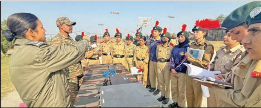
NCC cadets at Somgarh Military Station (Old Air Field), Srinagar.

■ STATE TIMES NEWS SRINAGAR: A 12-day Army Attachment Camp for NCC cadets successfully concluded at Somgarh Military Station (Old Air Field), Srinagar. The camp was organized under the combined aegis of the Chinara Corps, Chinara Army Defence Brigade, and coordinated by the 9 J&K Girls Battalion, Srinagar, part of the J&K & Ladakh Directorate. A total of 117 cadets, including both boys and girls from various educational institutions across Jammu & Kashmir, participated in the camp. The primary objective was to give the cadets first-hand exposure to the Indian Army's ethos, professional lifestyle, and rigorous training standards. The camp aimed to instill in them the values of discipline, leadership, teamwork, and national pride. Throughout the camp, cadets took part in a variety of structured activities. They received hands-on exposure