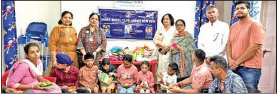
IWC New Gen Jammu donating a range of essential items at SAHYOG.

SAHYOG continues to serve as a pillar of hope and compassion for specially abled children by providing them with care, education, and rehabilitation services. The organization relies on the generosity of individuals and groups to sustain