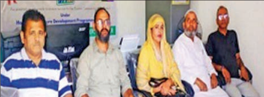
Officials during the programme.