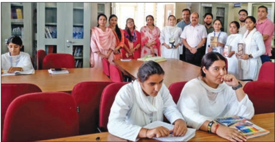
Students and officials during the event.