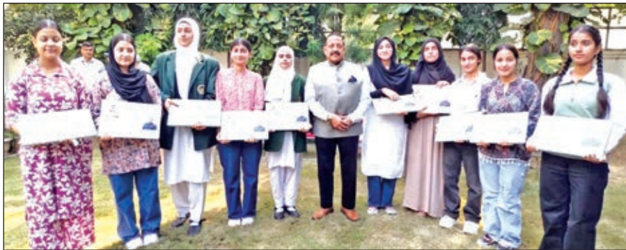
Union Minister Dr Jitendra Singh felicitating and interacting with school girls from Udhampur-Kathua-Doda LS constituency on Wednesday.

lages and towns of these districts. He said the laptops presented to students as a Diwali gift would encourage them to continue their academic pursuits. While interacting with the students, Dr Jitendra said, in the last 11 years, Prime Minister Narendra Modi-led government has ensured ease of education and preparation for students in view of a surge in their aspiration. He said the National Education Policy 2020 (NEP) has given students freedom to choose subjects according to their aptitude. He said the policy has given them wings to fly high in pursuit of their dreams and aspirations.