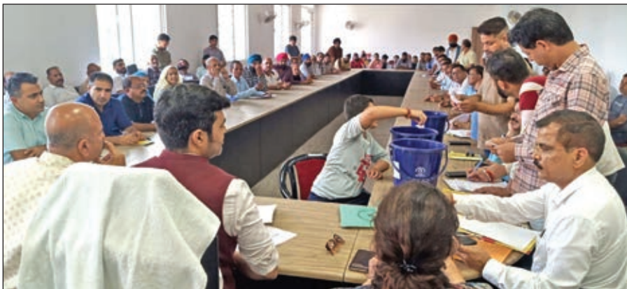
JMC officials conducting draw of lots for allotment of newly constructed modern kiosks.

The newly constructed kiosks have been designed in three different standardized sizes - 4x10 ft, 6x10 ft, and