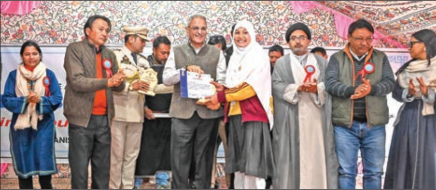
Lt Governor Ladakh, Kavinder Gupta felicitating a student.

Addressing the gathering, Kavinder Gupta underlined that developing a scientific outlook among students is