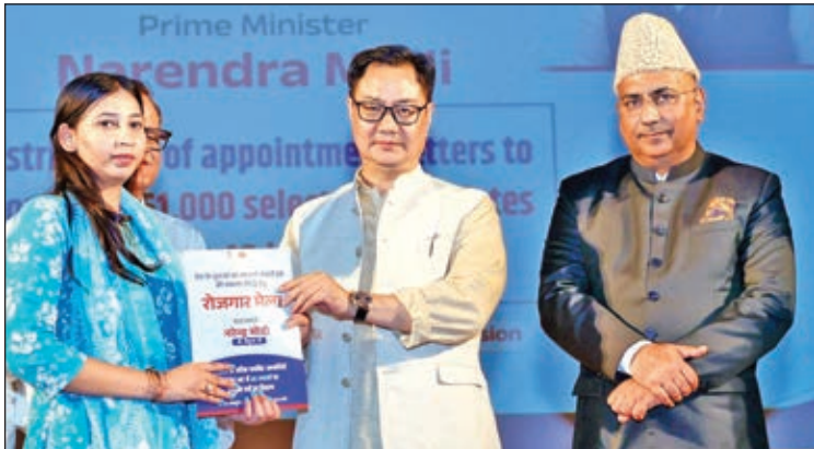
Union Minister Kiren Rijiju handing over appointment letter to newly recruited candidate at Rozgar Mela in Jammu on Friday.

"I have personally felt that under the leadership of Prime Minister Modi and after the abrogation of Article 370, the destiny of Jammu and Kashmir has changed. Today,