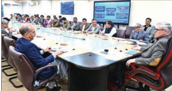
CM Omar Abdullah chairing meeting at Srinagar.