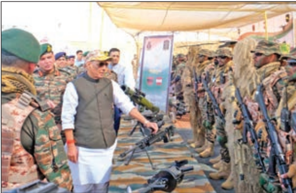
Defence Minister Rajnath Singh interacting with soldiers at Laungewala in Rajasthan on Friday.

In an address to top Army commanders in Jaisalmer, Singh urged them to focus on information warfare, development of modern defence infrastructure, and modernisation of the force to effectively deal with future challenges.