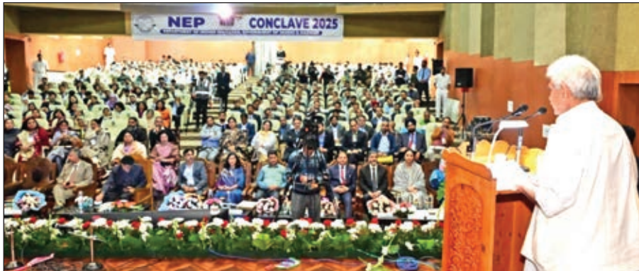
LG Manoj Sinha addressing inaugural session of NEP Conclave 2025 at Srinagar.