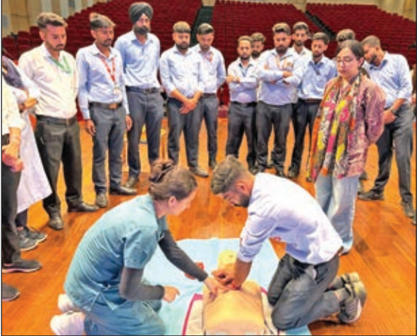
Hands on demonstration of CPR Technique among housekeeping staffs.

■ STATE TIMES NEWS JAMMU: As per the directives of the Ministry of Health and Family Welfare, Government of India, the Cardio Pulmonary Resuscitation (CPR) Awareness Week was observed at All India Institute of Medical Sciences (AIIMS), Vijaypur, Jammu from 13th to 17th October 2025. The objective of the week was to enhance awareness and skills of this essential life-saving intervention among healthcare professionals, students, and the general public, thereby strengthening the chain of survival within the institution and community settings. The week commenced with a CPR Pledge on 13th October 2025 at 10:30 AM, led virtually by the Health Secretary.