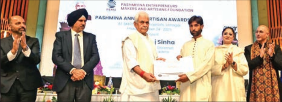
Lieutenant Governor, Manoj Sinha honouring artisan at Pashmina Artisan Awards Ceremony organised by Pashmeena Entrepreneurs Makers & Artisans Foundation.

■ STATE TIMES NEWS SRINAGAR: "Buy local and empower our great artisans", the Lieutenant Governor, Manoj Sinha urged the people while addressing the Pashmina Artisan Awards Ceremony organised by "Pashmeena Entrepreneurs Makers & Artisans Foundation" on Friday at Srinagar. The Lieutenant Governor said every household in the country must buy a creative product made of master artisans of the UT. "I am confident the nation's growing middle class, which could make up over half the population by 2030, will create a strong domestic market for J&K's handmade products," the Lieutenant Governor said. Highlighting the crafts-