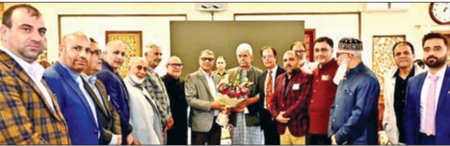
KCCI delegation members calling on Lieutenant Governor Manoj Sinha.