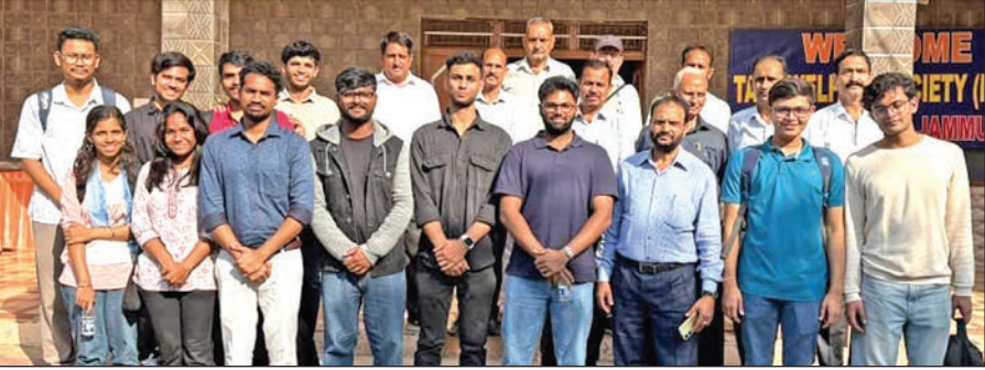
IIM Jammu students with others at Day 2 of Bandhan Program.

Host families appreciated the initiative and expressed pride in sharing their traditions with the future leaders