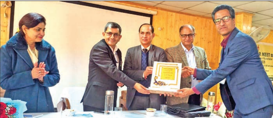
Director, CSIR-IIIM Jammu presenting award to an entrepreneur at Buyer-Seller Meet.