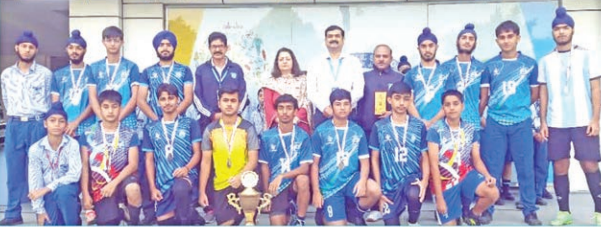
JK Public School Kunjwani faculty felicitating winner students.

JAMMU: The Under-17 Boys Football Team of JK Public School, Kunjwani, brought laurels to the institution by securing the