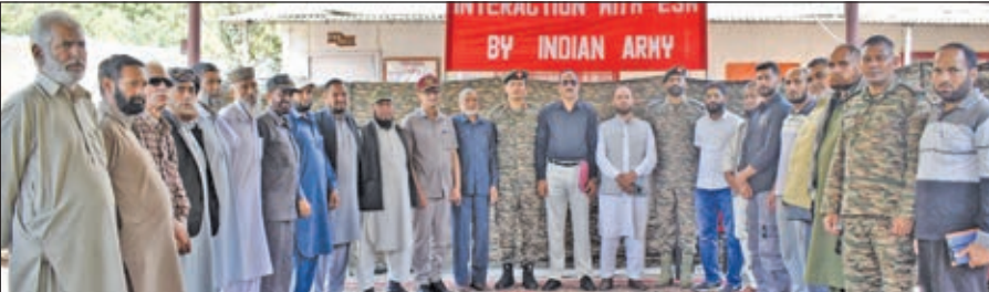
Army officials with Ex-Servicemen during interaction programme.

■ STATE TIMES NEWS RAJOURI: An interaction with Ex-Servicemen (ESM) was organized by the Indian Army at Samote. The event was aimed at reaffirming the Indian Army's continued commitment to the welfare of its veterans, providing a platform for direct engagement and addressing their concerns effectively. The