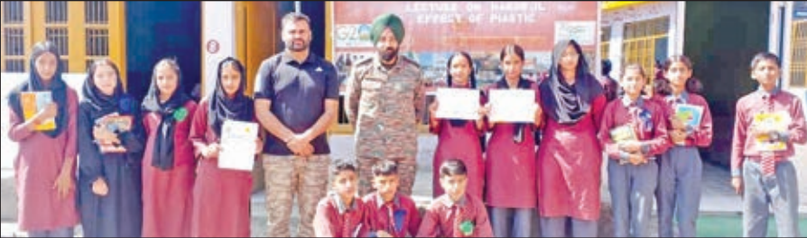
Army officials with students and faculty at drawing competition.

■ STATE TIMES NEWS RAJOURI: As part of the Swachhata Hi Seva Campaign 2025, the Indian Army organized a Drawing Competition for school students at Crescent Public School, Budhal. The event, based on the theme "Clean, Green and Sustainable Station," saw enthusiastic participation from young