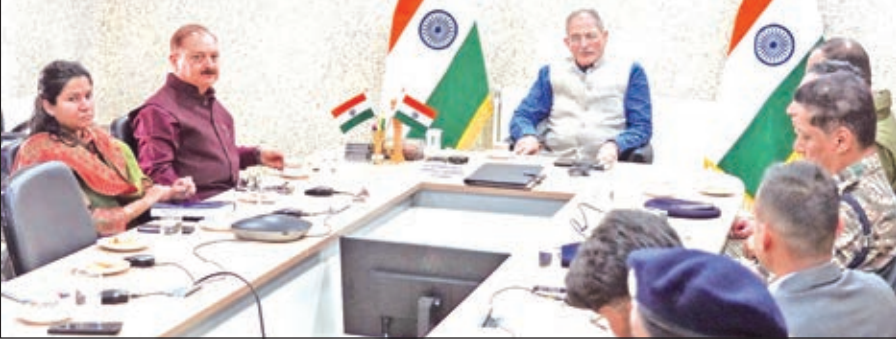
Lieutenant Governor of Ladakh, Kavinder Gupta chairing a high-level meeting.

■ STATE TIMES NEWS LEH: The Lieutenant Governor of Ladakh, Kavinder Gupta, on Monday chaired a high-level meeting to review the current security situation in Leh and across Ladakh. The Lt Governor observed that the Union Territory remains peaceful, with schools, offices, and markets operating normally. He directed officials to remain vigilant and continue focusing on maintaining peace, public safety, and facilitating overall development in the region. The Lt Governor appreciated the cooperation of the local populace and commended the security forces for their dedicated efforts in ensuring stability. He emphasised the need for coordinated action to uphold law and order while promoting growth and prosperity in Ladakh. The Lt Governor reiterated