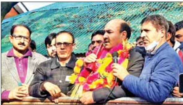
EJAC leader addressing gathering after elections.