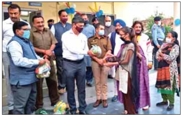
Sangram Sena members distributing eatables among inmates of Ved Mandir Amphalla.