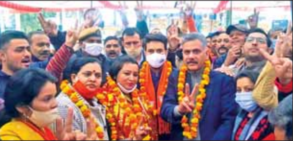
Union Minister Anurag Thakur along with BJP leaders after filing of DDC nomination paper by candidate.

While addressing the gathering, Anurag highlighted the achievements of Narendra Modi and the beneficial policies of BJP particularly for farmers, border residents of villages like construction of bunkers in