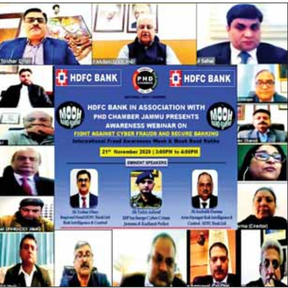
HDFC officials & PHDCCI members during a webinar.

From celebrations to anger, from euphoria to despondency, from pride to humiliation, it has seen a wide spectrum of emotions reflected through millions of conversations on social media. Article 35A, which comes under Article 370, proscribes non-permanent residents of J&K from permanently settling in J&K, buying immovable property, acquiring land, applying for Government jobs or any kind of scholarships, aids as well as other public welfare projects. The people of J&K will now lose these benefits associated with permanent resident certificate. Moreover, as per my view, what has been promised is not being delivered to us."