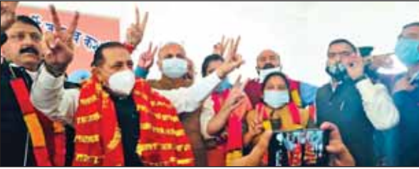
Union Minister Dr. Jitendra Singh with the BJP candidates for DDC election, during workers meeting at Kathua.

KATHUA: Union Minister Dr Jitendra Singh said here on Sunday that the Dogra pride had been sabotaged by self-styled Dogra protagonists who were now raising this bogey after having spent lifetime eating loaves and fishes of power with Congress or National Conference, the two political parties which were responsible for the oppression, imprisonment and torture of Pandit Prem Nath Dogra, the tallest Dogra of our time and the same parties which had banished Maharaja Hari Singh, the last Dogra ruler, to exile and forced him to live and die in Mumbai. In a hard-hitting dig, while addressing the BJP party workers and party candidates for District Development Council election here, Dr Jitendra said, the "Gupkar Gang" of Kashmir is matched by the "Guftar Gang" from here and quoted an Urdu couplet by Allama Iqbal ".... Guftar Ka Qazi Ban To Gaya, Kirdar Ka