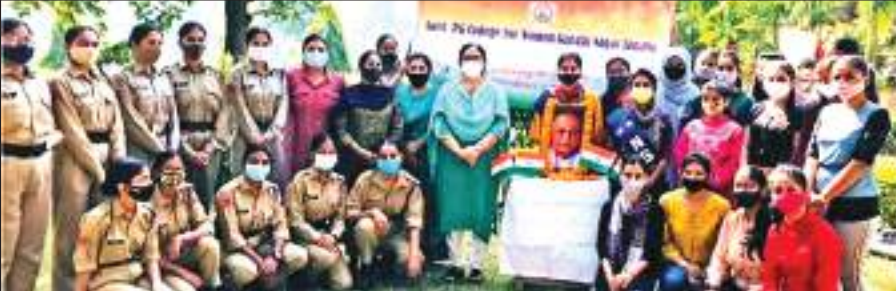
Students, NCC cadets and faculty of GPGCW Gandhi Nagar paying tributes to Sardar Vallabhbhai Patel.