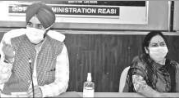
Deputy Commissioner Reasi Charandeep Singh interacting with PRIs during the meeting.

Speaking on the occasion, the DC informed the PRIs about the Land Record Information System and said that now public users can search and view copies of scanned data online on CIS portal :- http://landrecords.jk.gov.in/ .