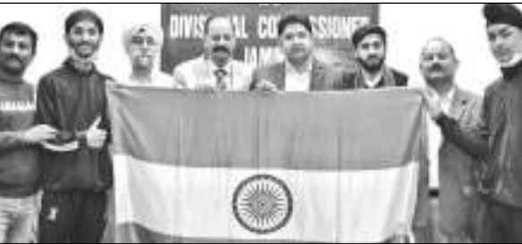
Divisional Commissioner Jammu Dr Raghav Langer along with players during the programme.

Kavinder said that the needless statement in the controversial book of the Congress leader simply divulges the appeasement policy of the party but the people in the country irrespective of their caste, colour and creed know well that it is only BJP which can bring about the desirable changes meant for satiating aspirations of the people and Congress and its ilk are good for nothing as they performed dismally during 70 years of their rule and did nothing except looting the country.