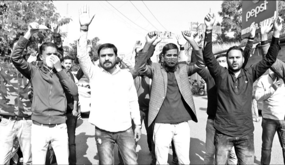
SI aspirants raising slogans during a protest.