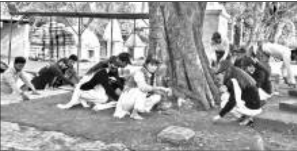
Students carrying out cleanliness drive.