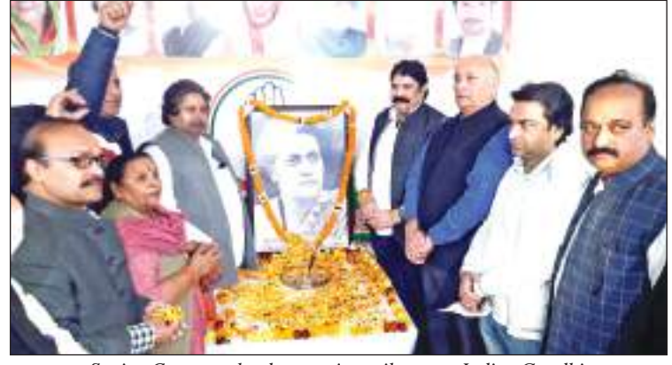
Senior Congress leaders paying tributes to Indira Gandhi.