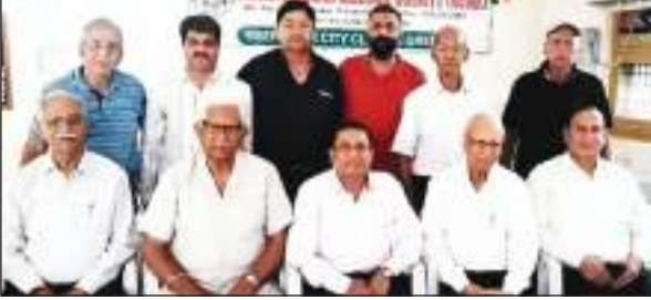
TNWS members during a meeting at Jammu.