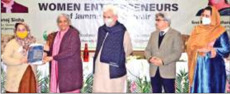
Union Finance Minister, Nirmala Sitharaman honouring a woman entrepreneur.

Maa Sharada and that absolute power-packed knowledge-driven energy is what has come out here. I appeal to you to move around the country and share your stories", she remarked.