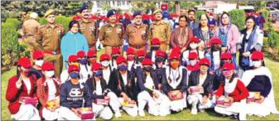
IRP 18th Bn officials posing with students and teachers during visit to Balidan Stambh.

Around 150 School Students of J&K Police Public School Miran Sahib, Government Girls Higher Secondary School Shastri Nagar, Government Higher Secondary School Bahu Fort, Government High School Qasim Nagar and Government Girls High School Gandhi Nagar alongwith their teachers were taken to Balidan