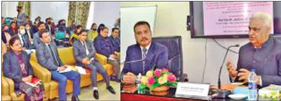
Former Judge, High Court of J&K, Justice J.P Singh speaking at a training programme.