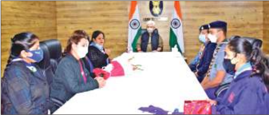
Lieutenant Governor Manoj Sinha interacting with J&K Bharat Scouts & Guides delegation members.

The Lt Governor, who is also the Chief Patron