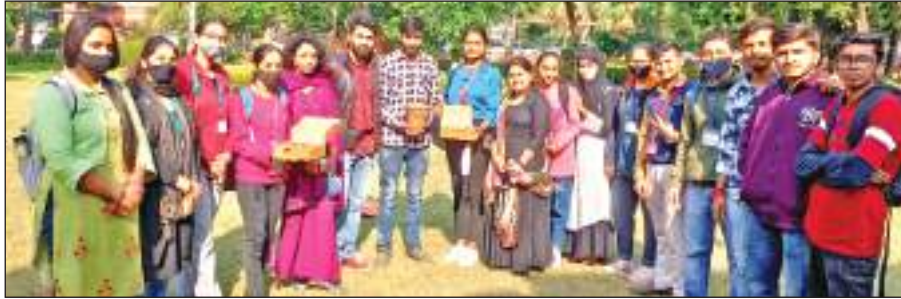
NSS volunteers along with faculty members during Diwali celebration.