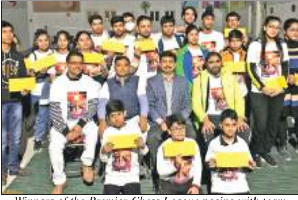
Winners of the Premier Chess League posing with team owners and officials at Jammu on Tuesday.

The event was conducted as per FIDE laws of chess and