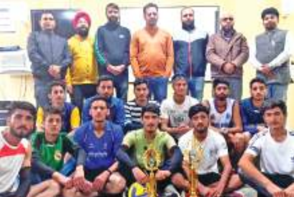
Winner team posing with officials after receiving trophies.