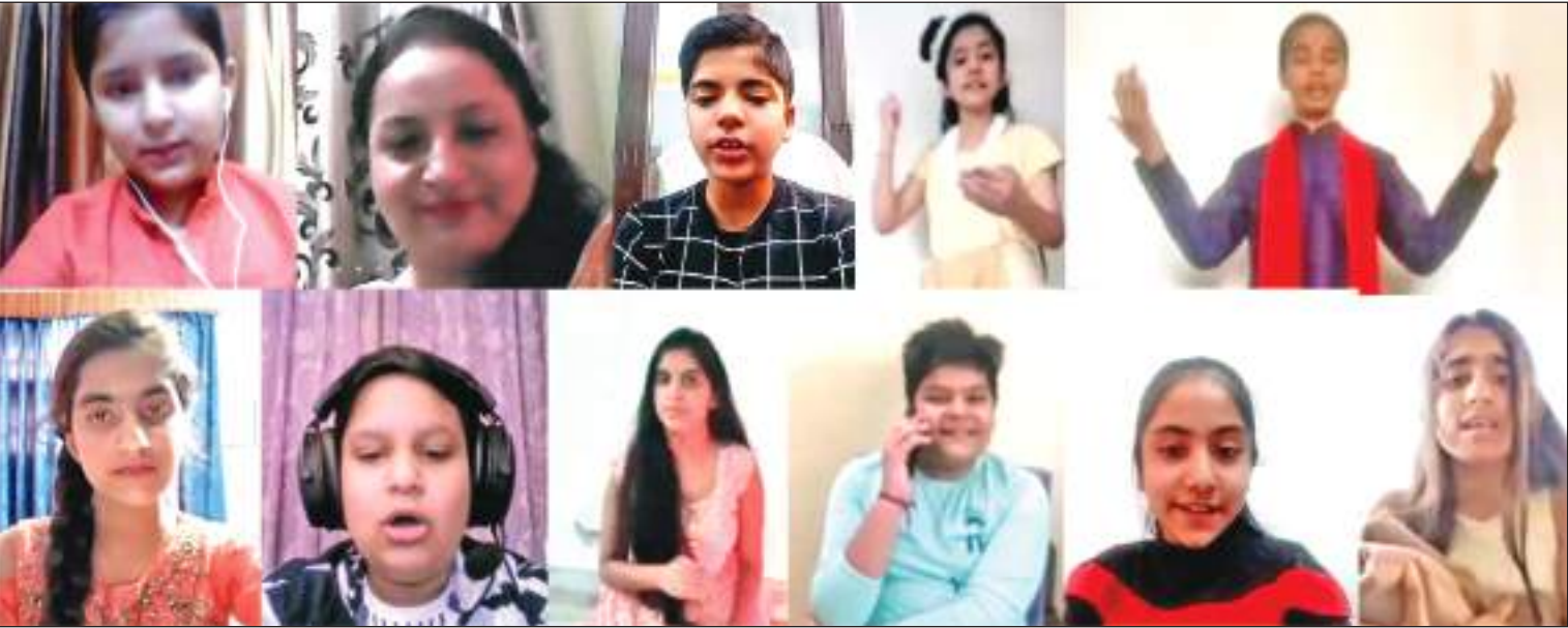
Students of JK Public School Kunjwani displaying their talent during Virtual Drama Club show.

JAMMU: JK Public School, Kunjwani conducted a virtual Drama Club show on Wednesday with great enthusiasm, zeal, fun and frolic.