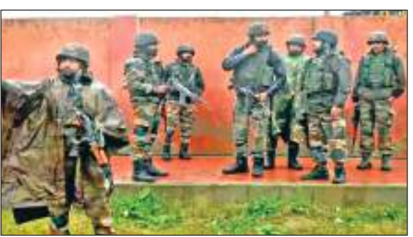
to the SMHS hospital, where doctors declared him brought

They said the cop was critically injured and was taken