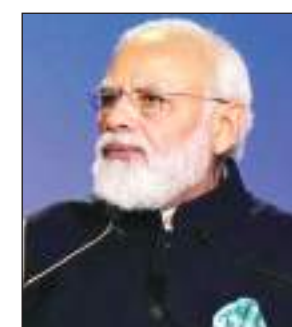
Samparan (service, resolution and commitment)" and "does not revolve around a

Addressing the valedictory session of the BJP's national executive, Modi stressed that the BJP runs on the values of "Sewa, Sanklap