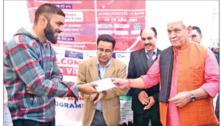
Lieutenant Governor Manoj Sinha handing-over J&K Bank's loan sanction letter to a youth.