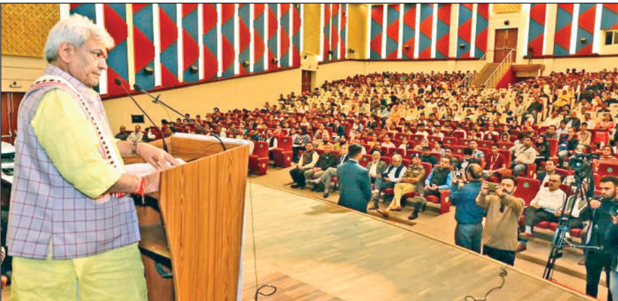
LG Manoj Sinha speaking at the 'Meritorious Students Award' function of Amar Ujala in Jammu on Thursday.