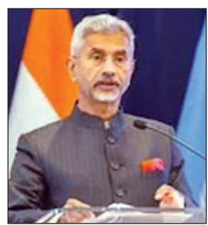
Hindustan Times Leadership Summit.

"I am saying that unless there is peace and tranquillity in the border areas, unless there is observance of agreements and no unilateral attempt made to change status quo, the relationship cannot be normal and is not normal," Jaishankar said at the