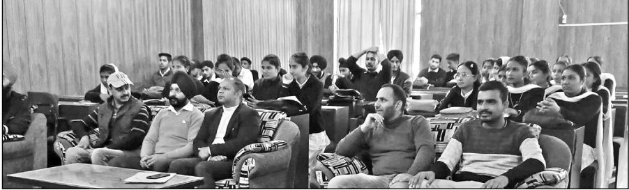
Dignitaries along with faculty and students during the programme.