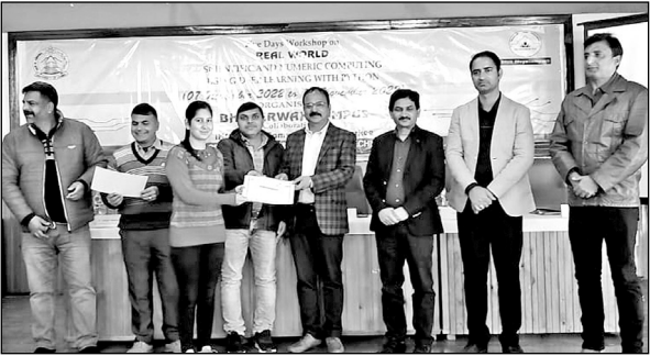
Participants being presented certificates during the programme.