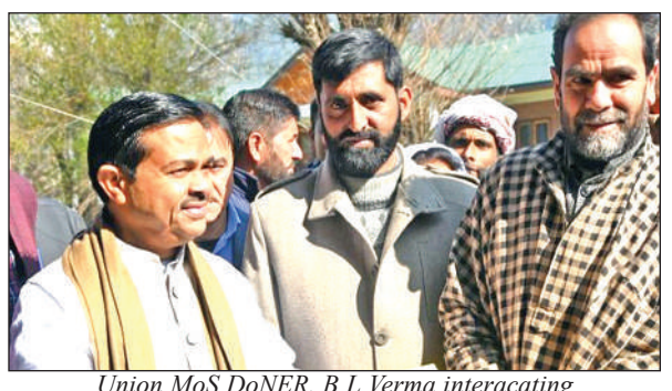
Union MoS DoNER, B L Verma interacting with people at Anantnag.

"Prime Minister, Narendra Modi has taken various steps for welfare of the common man and rapid development is being witnessed across J&K", the minister said while beginning his two day tour of Anantnag district as part of the ongoing public outreach programme of the Central Government and reviewed the development scenario of the district. The Minister also remarked that the UT administration under the leadership of Lieutenant Governor, Manoj Sinha has designed suitable interventions to address the problems