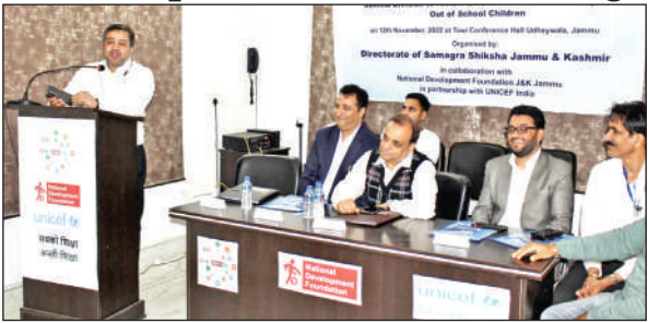
A dignitary speaking at a workshop in Jammu.