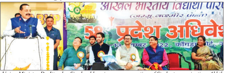
Union Minister Dr Jitendra Singh addressing a congregation of Student organisation, Akhil Bharatiya Vidyarthi Parishad at Jammu on Saturday.