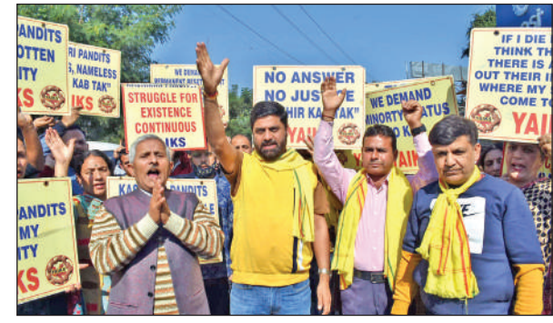
Kashmiri Pandits raising slogans during a protest.

"The situation, that is unfolding in Kashmir, it is right time for the central gov-