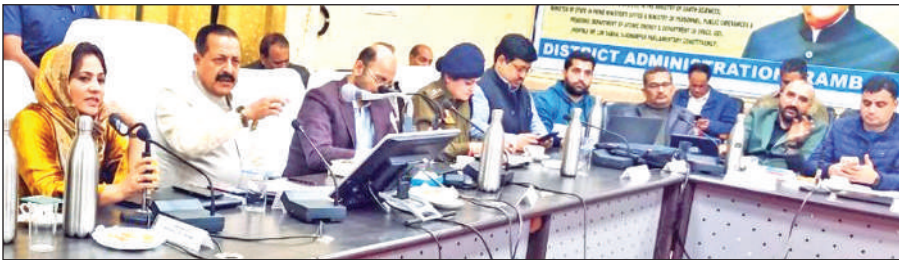
Union Minister Dr Jitendra Singh convening district DISHA meeting at Ramban on Sunday.

detailed presentation on the achievements and progress recorded under different Centrally Sponsored Schemes was made, giving an overview of various major projects being executed by different departments and agencies in the district. Senior officials of the District gave the status of scheme-wise physical and financial progress of projects being executed under various CSSs.