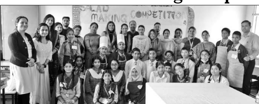
Winner students posing for a photograph with faculty and jury members.

■ STATE TIMES NEWS JAMMU: Playway House Higher Secondary School hosted inter school salad making competition under