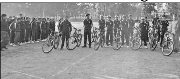
Cyclists and others students at Sainik School Nagrota.