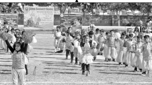
Toddlers of JSS Jammu presenting cultural programme.