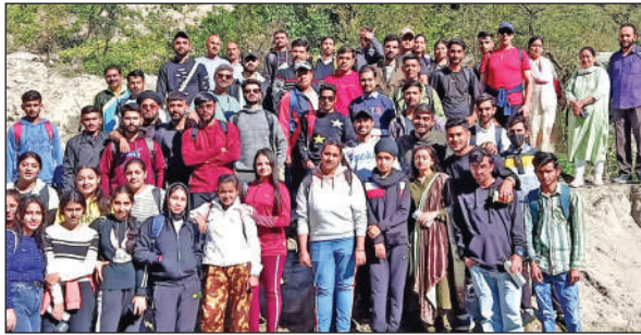
Students and faculty of Government Polytechnic College Jammu during a trekking.

JAMMU: Government Polytechnic College Jammu organized Trekking involving its students and staff members from Aithem to Baba Bhaid Devta and back covering a distance of eight kms through the jungle using the narrow pathways, ravines, and small tributaries of Tawi river.