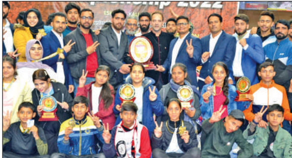
Winner team receiving trophy at Srinagar.

The event was organised by J&K Arnis Association under the aegis of Arnis India Federation involving 422 players and 60 Referees from 15 states and UTs of the country in both boys and girls sections, a