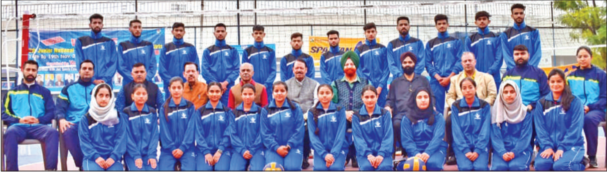
J&K Boys and Girls teams posing for a photograph with office-bearers of VAJK at Jammu.