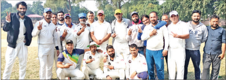
Media-XI team posing for a photograph after winning the match at Jammu on Sunday.

Sachin took the opponent bowlers to the cleaners emassing 80 runs partnership in 63 balls. Rising bowlers, Ashvani and Skipper Dixit took 5 quick wickets to