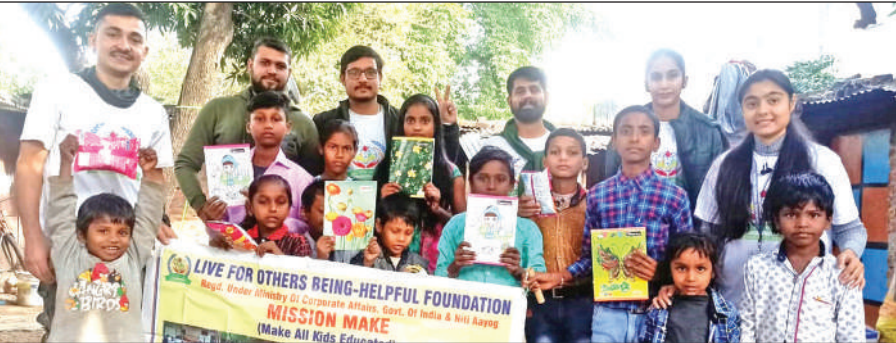
LFO-BHF members distributing stationary items among under-privileged children.